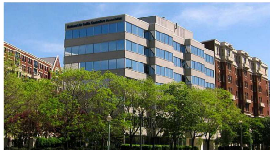
National Stonewall Democrats office in the Logan Circle area of Washington, D.C.

Stonewall membership is open to all Democrats, regardless of sexual orientation.