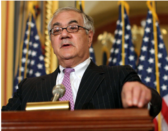
U.S. Rep. Barney Frank of Massachusetts (ret)

National Stonewall Democrats is a Washington-based LGBT rights group affiliated with the Democratic Party. The word "Stonewall" in group's name refers to the Stonewall riots of 1969, a pivotal event in the history of protecting equal rights for LGBT people.